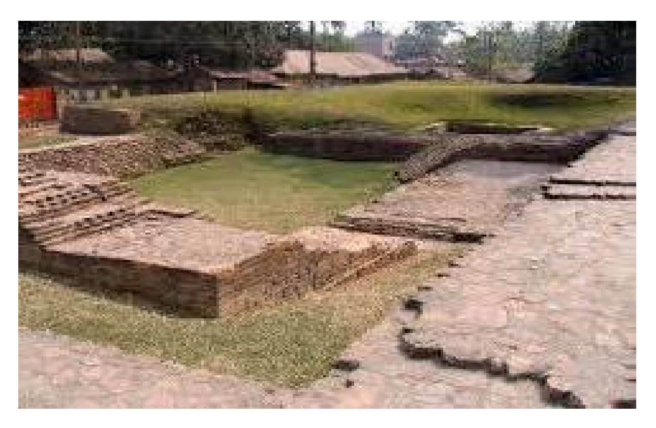
CHANDRAKETUGARH: THE ANCIENT PORT CITY

West Bengal can boast of many ancient historical locations of which one of utmost importance is the archaeological site of Chandraketugarh situated in Berachampa of North 24 Parganas. Sites of Haroa, Debalaya, Hadipur, Singherati, etc. have yielded similar relics of ancient Bengal.